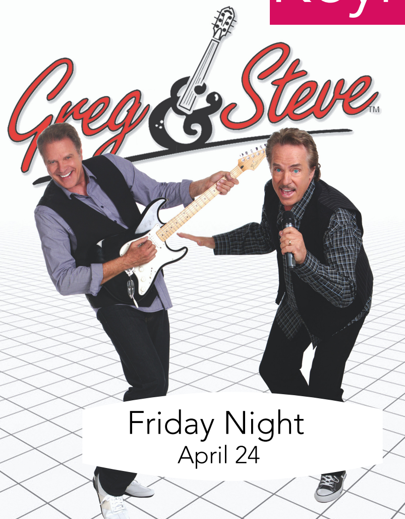
Friday Night April 24